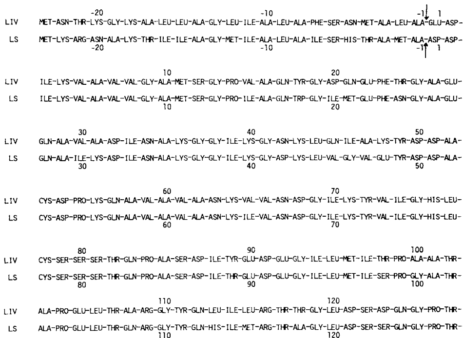
Fig. 1. Amino acid sequences obtained from DNA sequences [5] for the N-terminal portions of the precursors of LIV-BP and LS-BP. Amino acid sequence data for the mature forms of these proteins [3,6] were compared with these sequences to determine the locations of the processing sites. These sites are indicated by arrows.

core region consisting of hydrophobic amino acids, which is believed to be a helical structure in the membrane; and (3) the presence of several negatively charged or polar amino acids at or just past the processing site.