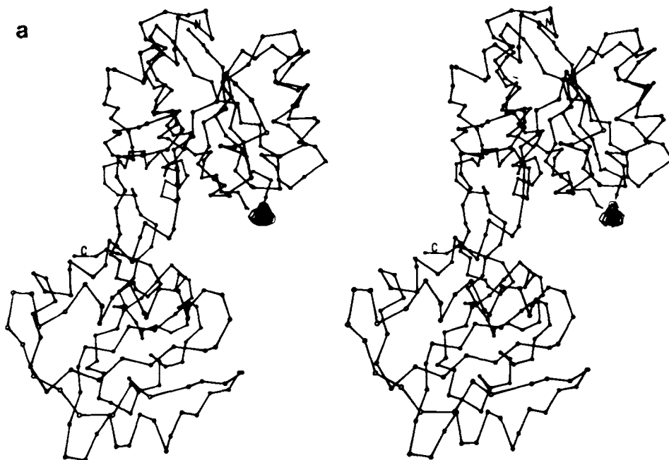
Fig. 2. Three-dimensional structure for mature LIV-BP. a) Stereo picture of the \alpha -carbon backbone (reproduced with permission from Saper and Quijcho [7]). b) Schematic representation of the domains of secondary structure observed in LIV-BP. The dark spot between the two lobes of LIV-BP in a) indicates the location of ligand doped into the ligand-free crystal. Helical regions in b) are numbered with Roman numerals, and regions of \beta -sheet are lettered in order of occurrence from the N-terminus.

the outside of the helix. Secondary structure predictions by the Chou-Fasman method [33] for the LIV-BP and LS-BP leader sequences give very high probabilities for \alpha -helix formation over most of the length of the leader sequences.